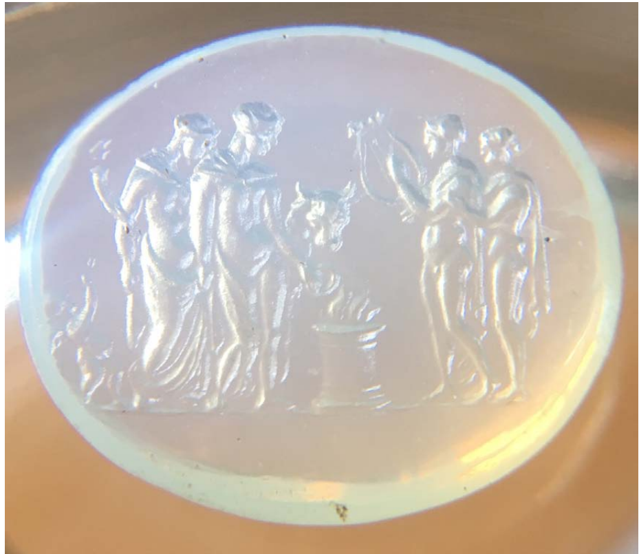
Fig. 5 Dido's Sacrifice to Juno, glass intaglio. Collection of Robert Wellington, Canberra.

That brings us to a heretofore unexamined aspect of the picture, namely the rug draped across Grosser's worktable