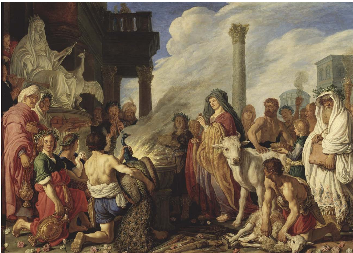
Fig 4 Pieter Pietersz. Lastman (1583–1633), Dido's Sacrifice to Juno , signed 1630. Oil on oak, 73.8 x 106 cm. Purchase 1857, transferred 1865 from Kongl. Museum. Nationalmuseum, NM 500

remains one of Vienna's luxury commercial avenues. 12 Grosser's house abutted the palatial residences of the high-ranking Esterházy, Pálffy, and Caprara clans. The imperial Hofburg was just down the street in one direction, while his father-in-law's house was mere steps in the other. 13 We learn further from a court diarist that Grosser extensively renovated and beautified this house. 14 But it was not simply as a jeweler that Grosser lived there: he opened a private bank that became one of Vienna's