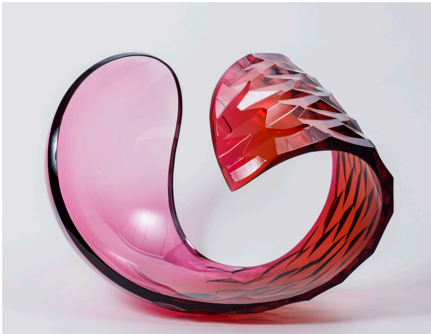
Fig. 2 Lena Bergström (b. 1961), Sculpture "Planets: Red Rose" . Produced by Orrefors Kosta Boda, 2013. Glass, blown, cut, 31 x 47 x 27 cm (h x l x w). Gift of the Friends of the Nationalmuseum, the Bengt Julin Fund. Nationalmuseum, NMK 211/2017.

their historic contents. We have also had numerous guided tours of the many sights and exhibitions available in Stockholm.