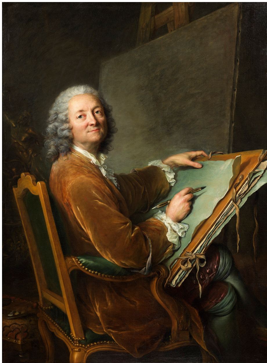
Fig. 5 François Hubert Drouais (1727–1775), Hubert Drouais, the Artist's Father , c. 1760. Oil on canvas, 30 x 97 cm. Gift of the Friends of the Nationalmuseum. Nationalmuseum, NM 7331.