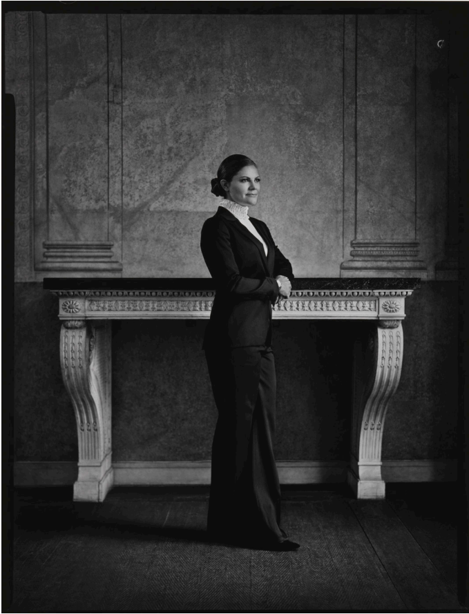
Fig. 3 Thron Ullberg (b. 1969), Victoria (b. 1977) Crown Princess of Sweden , signed "T. Ullberg -2017 2/10". Photography, 84 x 66.2 cm. Gift of the Friends of the Nationalmuseum. Nationalmuseum, NMGrh 5152.