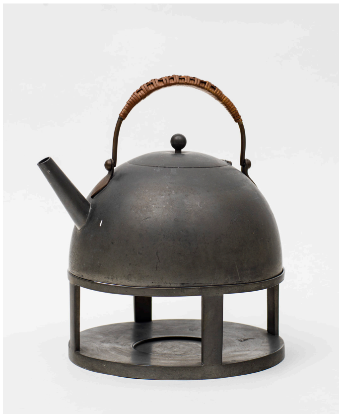
Fig. 7 Nils Fougstedt (1881–1954), Teapot . Produced by Svenskt Tenn, 1929. Tin, handle of copper wrapped with seaweed, 26.5 x 20 cm (h x diam). Gift of Ann Stern through the Friends of Nationalmuseum. Nationalmuseum, NMK 196/2018.