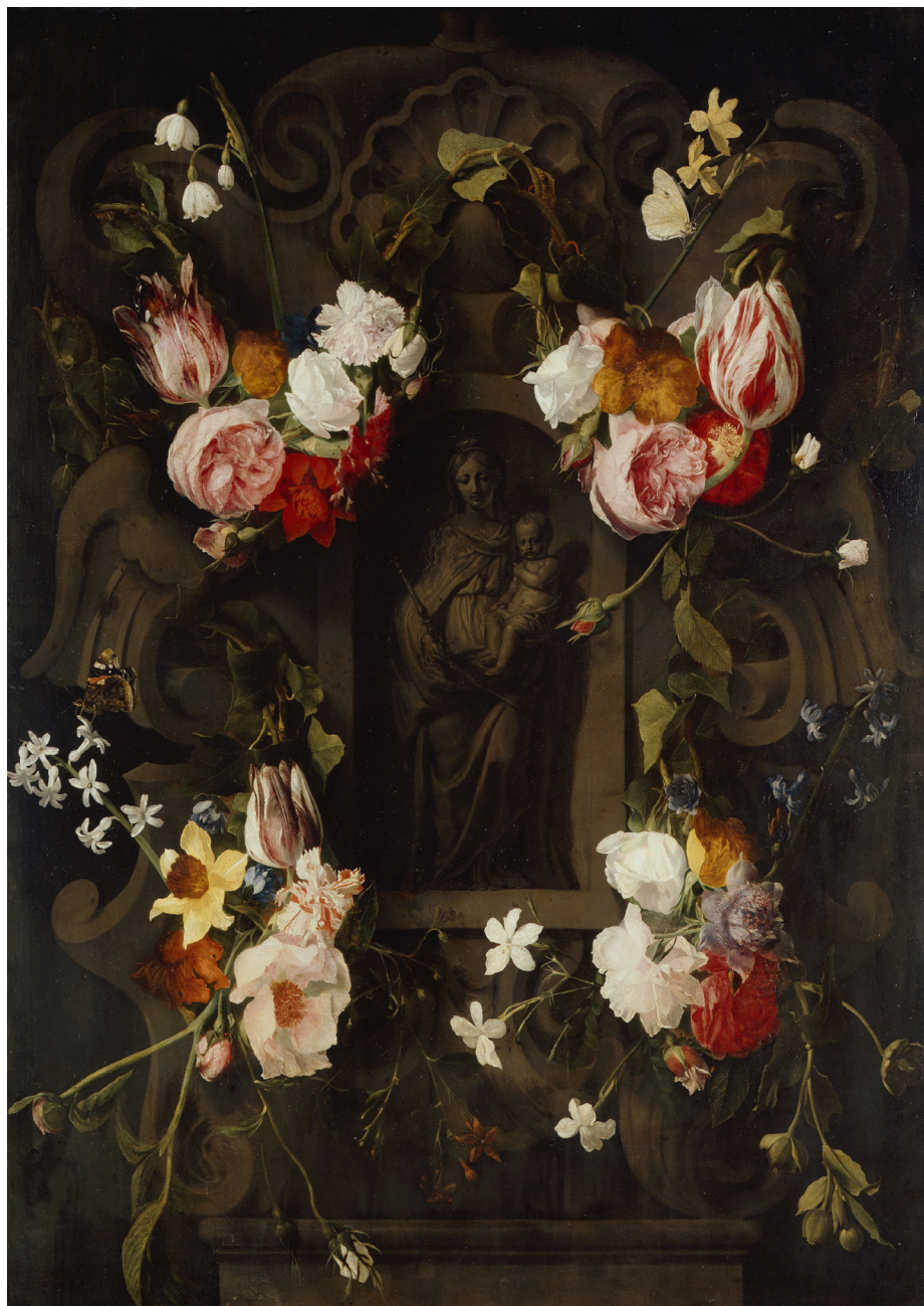
Fig. 2 Daniel Seghers (1590–1661) and Erasmus Quellinus the Younger (1607–1678), Cartouche with Flower Garlands and the Standing Virgin and Child , signed “D. Seghers. Soctis JESV”, c. 1645–50. Oil on copper, 86 x 62 cm. Herzog Anton Ulrich-Museum, Braunschweig, GG 111.

seems to protrude from an arched niche at the centre of a cartouche in grisaille with Baroque scrollwork. Draped around the cartouche are festoons with a vibrant assortment of meticulously painted blooms, gathered into four separate bouquets interwoven with swirls of ivy. Flowers and leaves are turned in different directions to expose them to strong light from the upper left, and depth is suggested by the use of shadow as well as the curvature of flower stalks and bristling foliage. A convincing three-dimensional effect is created by contrasting flowers in luminous primary colours with the dark grey, deeply shaded scrollwork.