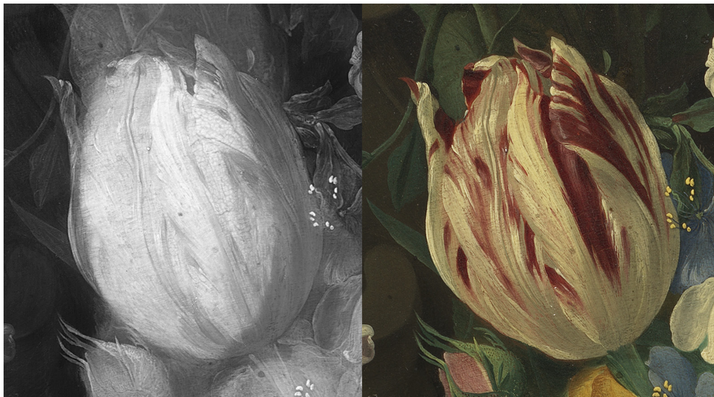
Fig. 4 Infrared reflectogram of Daniel Seghers (1590–1661) and Erasmus Quellinus the Younger (1607–1678), Flower Garland with the Standing Virgin and Child , c. 1645–50 (detail). Oil on copper, 85.5 x 61.5 cm. Purchase: Wiros Fund. Nationalmuseum, NM 7505.

organic forms flow, suggesting volume. Tulips were modelled by applying grey paint on the shadow side, next to the egg-shaped reddish-orange dead colouring: the dark colour shimmers through the semi-transparent top layer, while the adjacent bright dead colouring provides a base tone for the flowers' sunlit side. 17 The flame pattern was painted free-hand with flowing strokes of red lake, before areas of the underlayer were covered with more opaque white paint (Fig. 4). Pink roses were modelled by applying a dark pink glaze over bright pink dead colouring, the shape of the petals defined by delicate brushstrokes in pink and white, leaving ridges along the contours due to the non-absorbency of the metal support. Dots of