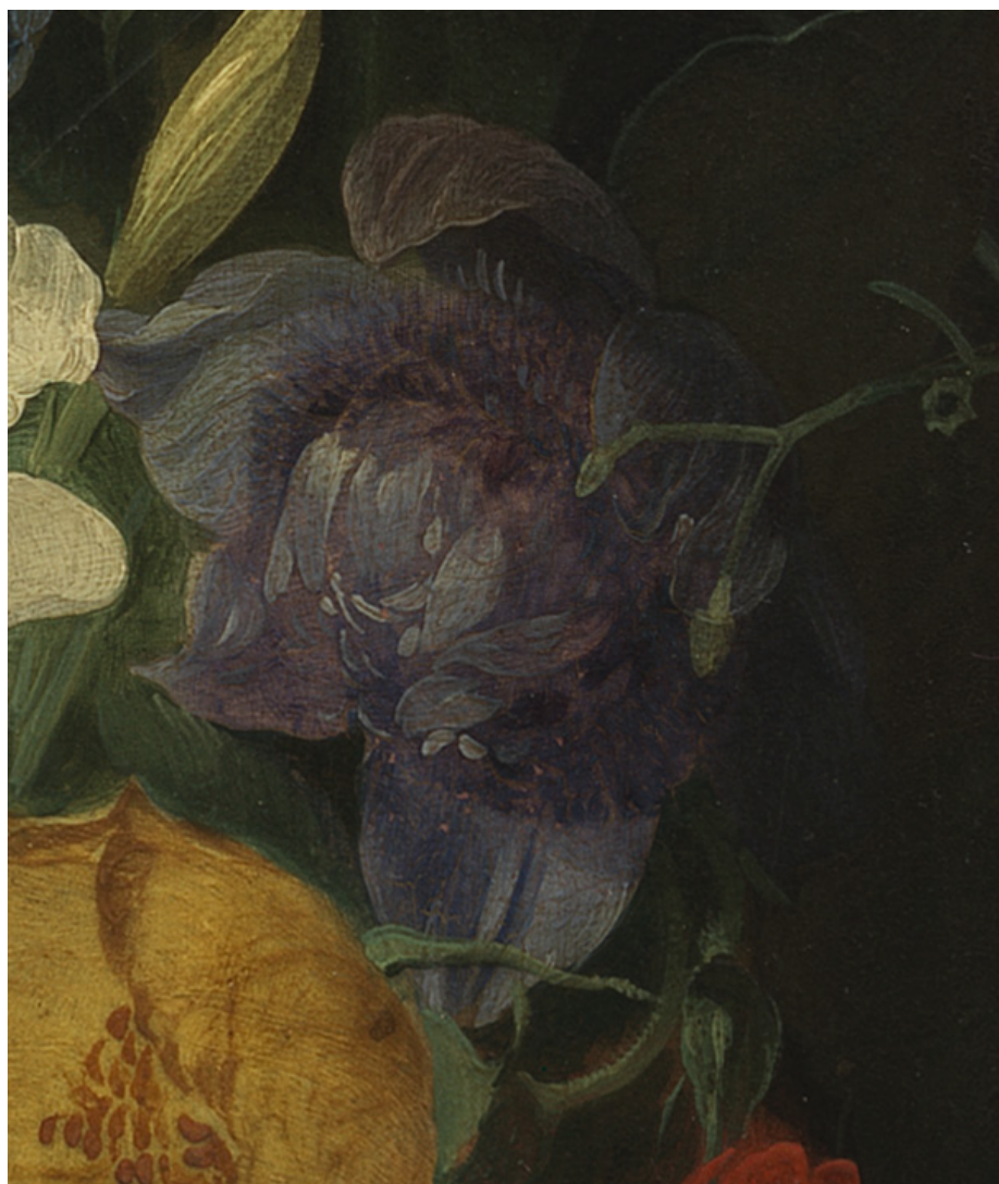
Fig. 5 Daniel Seghers (1590–1661) and Erasmus Quellinus the Younger (1607–1678), Flower Garland with the Standing Virgin and Child , c. 1645–50 (detail). Oil on copper, 85.5 x 61.5 cm. Purchase: Wiros Fund. Nationalmuseum, NM 7505.

10. So far, infrared reflectography suggests that Seghers copied his flowers free-hand (or used a material undetectable by IRR), rather than by