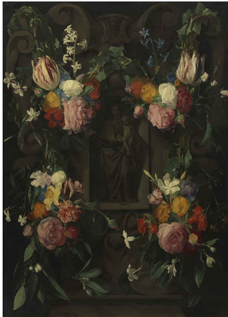
Fig. 1 Daniel Seghers (1590–1661) and Erasmus Quellinus the Younger (1607–1678), Flower Garland with the Standing Virgin and Child , c. 1645–50. Oil on copper, 85.5 x 61.5 cm. Purchase: Wiros Fund. Nationalmuseum, NM 7505.

Seghers transformed the painted flower garland first introduced by Jan Brueghel the Elder. 3 Having painted his first garland in Rome in c. 1626, 4 he soon developed a distinctive style, more dramatic and colourful than his teacher's. Dynamic compositions such as the Stockholm Flower Garland , with festoons elegantly arranged around a painted cartouche, and relying on strong chiaroscuro effects, became Seghers' trademark. 5 A sculpted Virgin and Child painted in trompe l'oeil